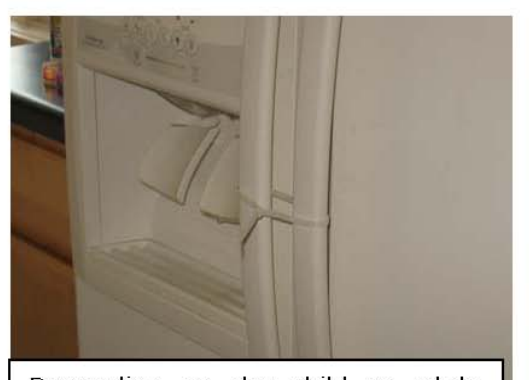
Depending on the child or adult, some families are able to use simple child-lock devices on the refrigerator. This would only be applicable for the person with PWS is not a strong food seeker.

Super glue was used to apply the above padlock to a lower freezer door. No drill was used; so the risk of hitting Freon coils was prevented.