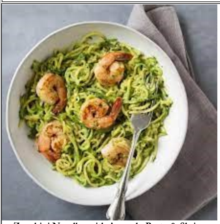
Zucchini Noodles with Avacado Pesto & Shrimp

Saturday May 7th Roosevelt Park in Oconomowoc We can't wait to see everyone in person!